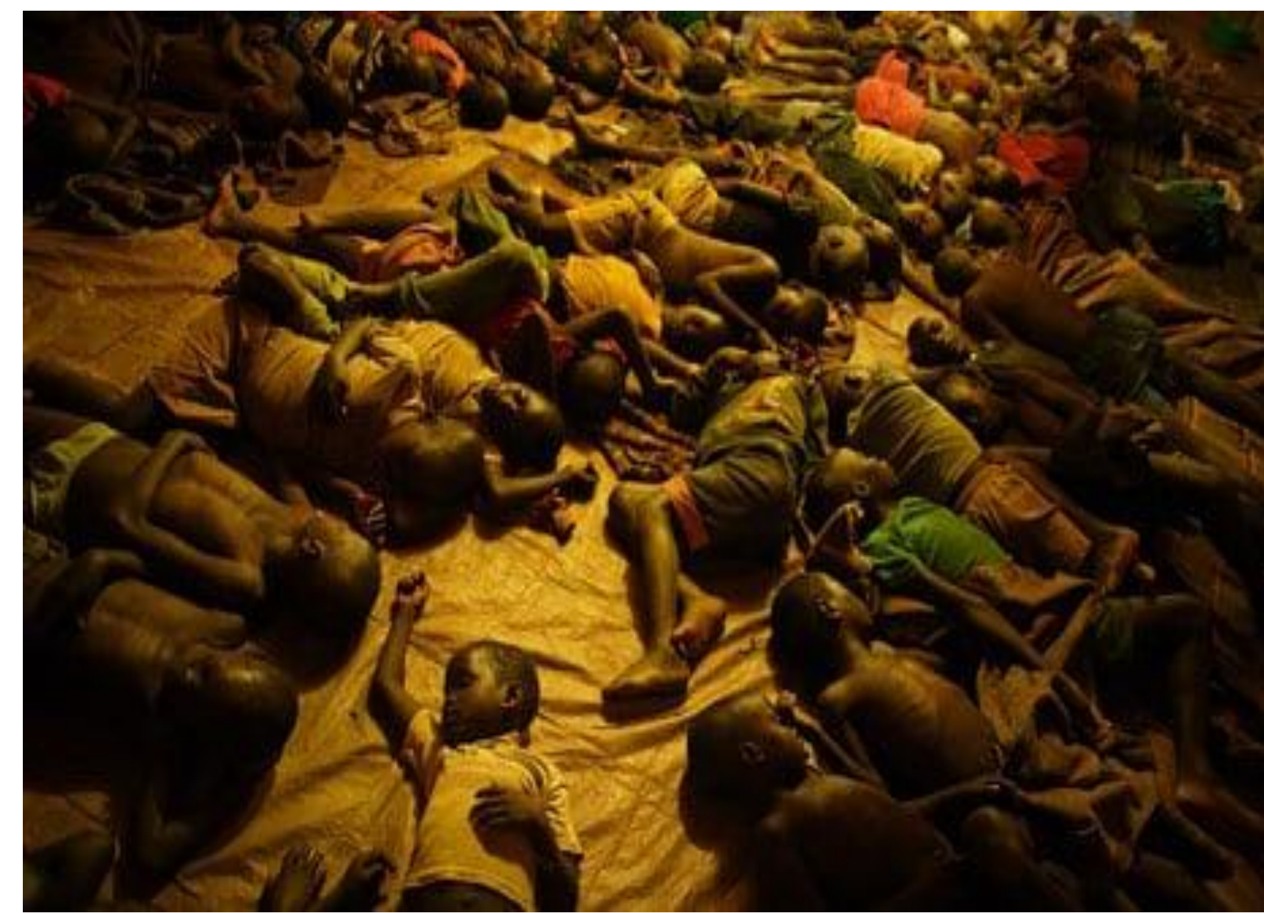
About 20,000 children were abducted by the rebels to serve as soldiers and sex slaves.

Many children were always sent by parents to townships in evening to spend a night there; it was seemingly safer than home but many were abducted on the way as they commuted